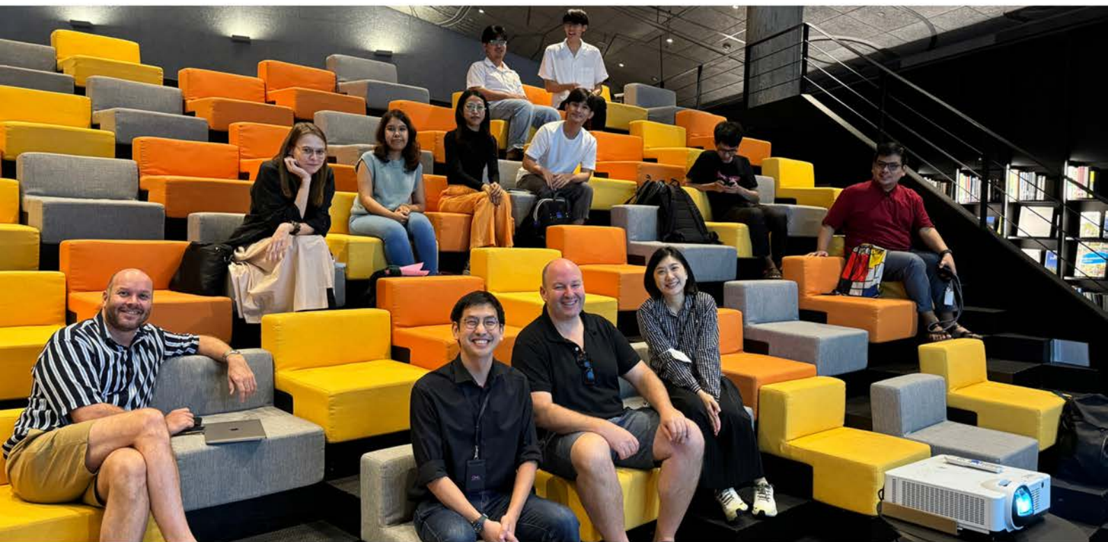
PlacemakingUS visiting Bangkok, Thailand - Lecture to Architecture Students

PlacemakingUS is a national network dedicated to helping communities across the United States transform public spaces into thriving hubs of connection, health, prosperity, and joy. As a 501(c)(3) non-profit project of Social Environmental Entrepreneurs, we provide tools, resources, and partnerships to empower local efforts in building vibrant, interconnected places that address the challenges of the 21st century.