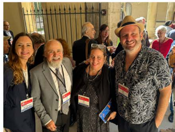
International Making Cities Livable Conference in Cortona